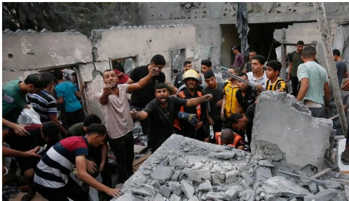
People search for victims and survivors following an Israeli strike on the town of Deir Al-Balah in the central Gaza Strip on October 18 2023.

LAHORE: Pakistani doctors' organisations have announced 'Black Day' on October 19 (today) throughout the country in protest against Israel's war crimes in Gaza and the world's criminal silence. Doctors and medical staff will wear black armbands and hold demonstrations against the heinous act of Israeli forces.